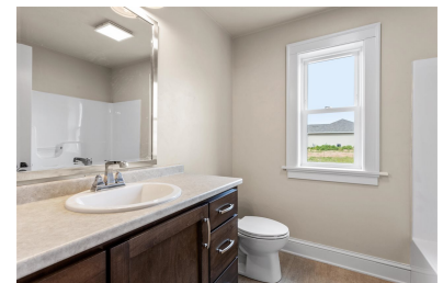
2nd Full Bath