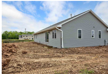
Side View of Lot