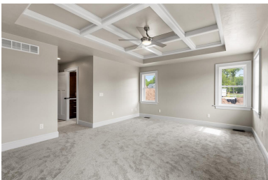
With Coffered Ceilings