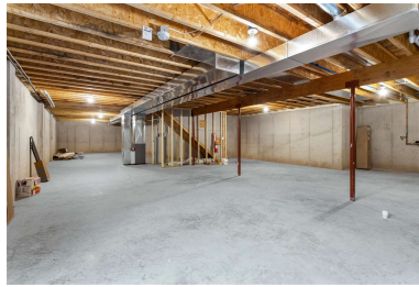
Full Unfinished Basement