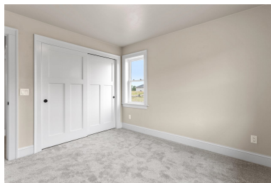
With Large Closet