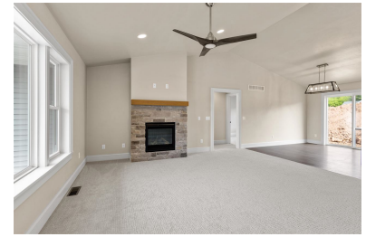
With Stone Fireplace