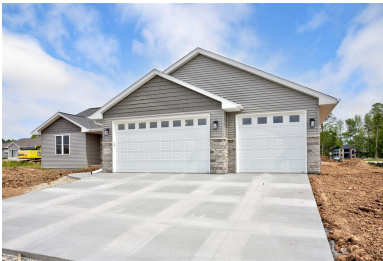
3 Car Attached