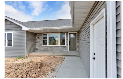
Covered Porch Entry