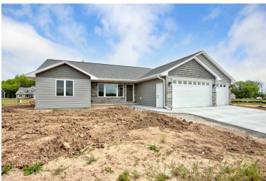
Ready For Your Final Design