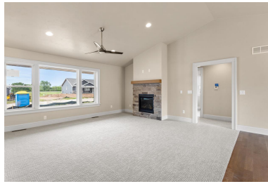
Picture Window in Living Room