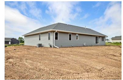
Back Yard View