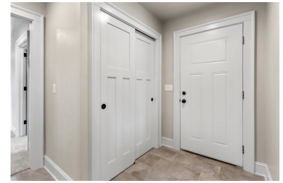
Garage Entry & Closet