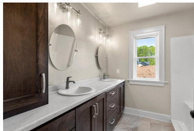
Dual Vanity In MBath