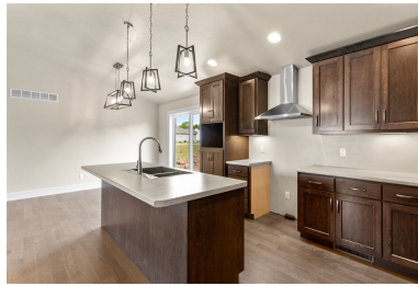
Pendant Lighting Over Island