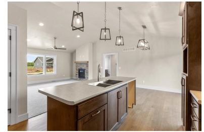
Open Concept to Living Rm & Dining